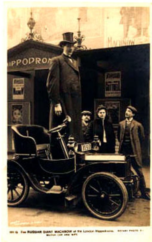
1811 - The RUSSIAN GIANT MACHNOW at the London Hippodrome. SEPARATE PHOTO OF MACHOW CAR AND WIFE